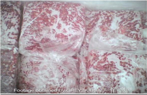
4-D Meat at Tucson Greyhound Park, 2010

At commercial racetracks across the country, greyhounds are fed a diet based on "4-D" meat. 1 This is meat derived from dying, diseased, disabled and dead livestock that has been deemed unfit for human consumption. 2 The United States Department of Agriculture requires that charcoal be added to this meat to discourage human use. 3