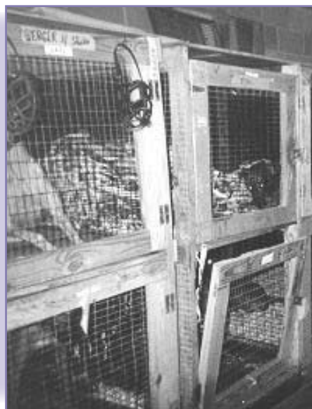
Kennel at a New Hampshire track

Amber's record, as well a report of all 2005 New Hampshire records is now available on GREY2K USA'S new web site at www.grey2kusa.org/action/nh.html .