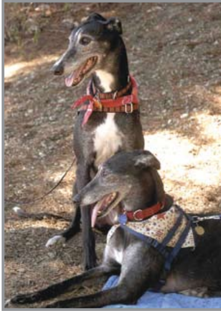
Felisha & Nitro